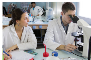
Practical work in biology at the faculty of science and technology

Students are selected on academic performance and motivation, language proficiency test and interview with the head of the program of their home university.